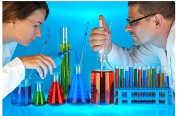
Providing ISO 17025 consulting and Training services across the world.